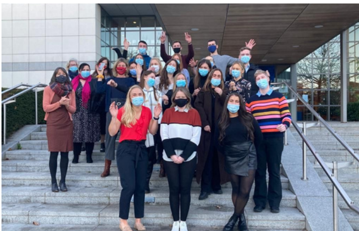
2022 Final Year MSc Clinical Nutrition and Dietetics Students