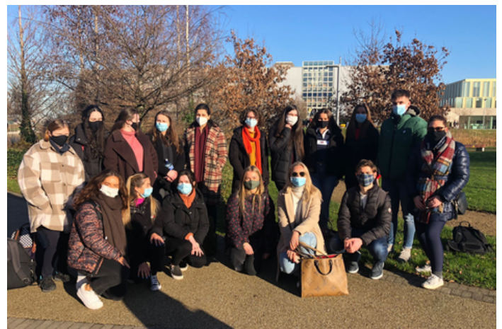
2022 Incoming MSc Clinical Nutrition and Dietetics Students